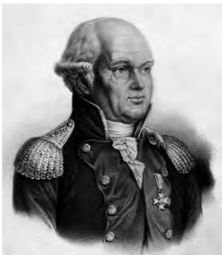
Figure 5. Abraham Gottlieb Werner (1749–1817). The influential teacher of ‘geology’ at Freiberg, Germany. Unaware of Barrett’s 1988 research on Karneev indicating that he definitely made a sketch, Anastasenko (pers. com.) wrote: ‘The artist probably captured this astonishing moment of nature as one or more series of drawings’. See Table 1 for evidence of two relevant sketches.