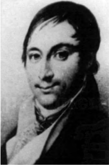
Figure 2. Lorents (Laurentiy Ivanovich) Pansner (1777–1851). Pansner was the first Director of the St Petersburg (Imperial) Mineralogical Society. Between 1819 and 1822 he was head of the Department of Mineralogy at St Petersburg University and the first director of the famous mineralogical collection (1819–1822). He studied more than 200 minerals and had travelled widely, examining mining localities and preparing maps of many parts of Asia, joining the provincial trigonometrical survey at St Petersburg in 1809, before curating the mineral collection. Pansner had contact with the famous German romantic poet, writer and naturalist J.W. Goethe (1749–1832), (Hennig 1949). Earlier he made his name by compilation and publication of a French-German Mineralogical dictionary and taking part in an expedition to China, acting as mineralogist and ‘historian’.