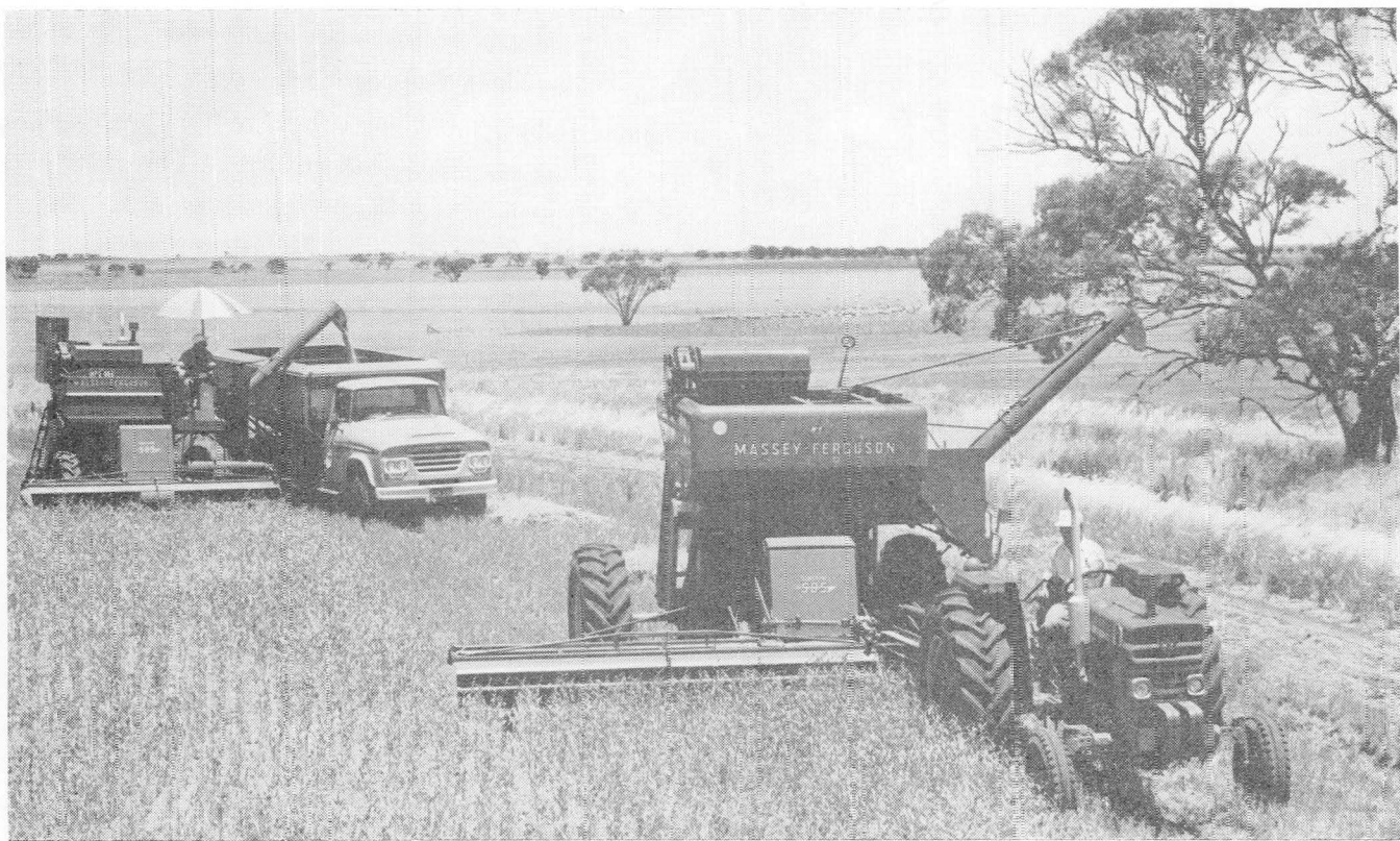
Wheat harvesting showing in background an auto-header, driven and operated by its own engine, an innovation of 1924, and in the foreground a power take-off header driven through couplings by the tractor engine which first appeared in 1928.