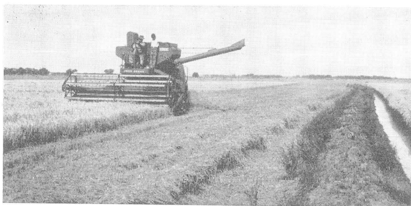
Auto-header in a rice crop in the Murrumbidgee Irrigation Areas. Commencing about 1928, rice-growing has become a most successful industry with average yields per acre being consistently amongst the world's best. A total of 212,000 tons of rice were harvested in New South Wales in the 1966-1967 season.

In New South Wales, the Robertson Acts had been only partially effective, and in 1884, a land Act was introduced which, in effect, marked the beginnings of resumption of leasehold station properties for closer settlement; although closer settlement, as we know it today, was not fully implemented until 1905. Large numbers of wheat farmers were attracted by the greatly improved facilities provided for land settlement under this Act, and later under the Carruthers' Crown Land Act of 1895. Few of the new farmers were now squatters turned wheat farmers—most came from other Colonies, notably Victoria and South Australia, and brought experience with them. Some purchased land, but others farmed on the share system with large land holders. The