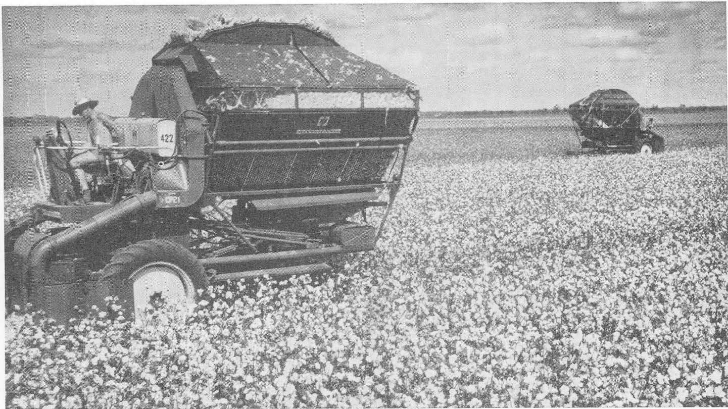
Harvesting cotton at Narrabri. Cotton-growing under irrigation in New South Wales is a development of the last seven years. Last season, 60,000 bales of cotton were harvested—an average yield of more than two bales per acre.