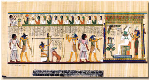
Figure 2: Papyrus showing weighing the souls of the dead and a copy of the Royal Cubit.

Counting (enumeration) of objects predates measurement as such, where the unit is ‘one thing’, but very quickly after the introduction of writing we see references to standards of length, volume and weight appearing in the Middle East, particularly Ancient Egypt and Mesopotamia, and in China. For example the Royal Cubit (Fig. 2), the length of the Pharaoh’s forearm and hand was used as a length standard in constructing the Pyramids and for monitoring the depth of flooding of the Nile in the period between 3000 and 2700 BCE (Clagett, 1999).