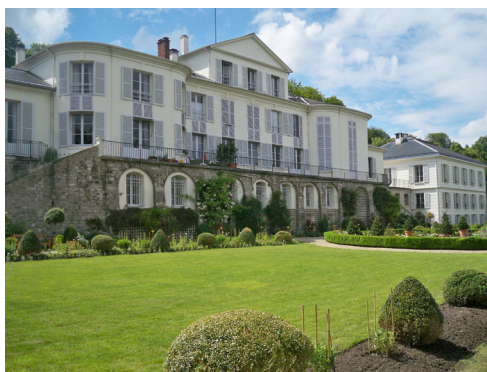
Figure 1: Pavillon de Breteuil, home of Bureau Internationale des Poids et Mesures (BIPM)

Metrology (no, not meteorology), is the science of measurement and has an international infrastructure that maintains our understanding of this important human activity. Eight international organisations 1 come together in the Joint Committee for Guides in Metrology and through its two working groups prepares the Guide to the Expression of Uncertainty in Measurement (GUM) (Joint Committee for Guides in Metrology, 2008) and the International Vocabulary of Metrology (VIM) (Joint Committee for Guides in Metrology, 2012).