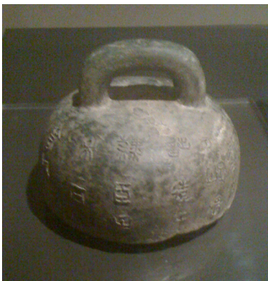
Figure 3: Chinese weight from the Warring States Period 244 BCE

Very quickly the utility of standards spread and we find examples in every society (Fig. 3).