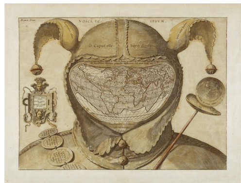
Figure 3: Fool’s Cap Map of the World.

One of the biggest mysteries in the history of western cartography is a rather sinister image offered by Fool’s Cap Map of the World, ca. 1580-1590 (cf. Figure 3). A possible interpretation of the map’s message is that “the world is a sombre, irrational and dangerous place, and that life on it is nasty, brutish and short. The world is, quite literally, a foolish place.” (Jacobs, 2014). And so, one may wonder if a “solution” to resolving numerous intricacies of our modern “post-truth” world, full of irrational and complex dependencies, should lie not within a novel mathematical framework, but rather in a new mindset.