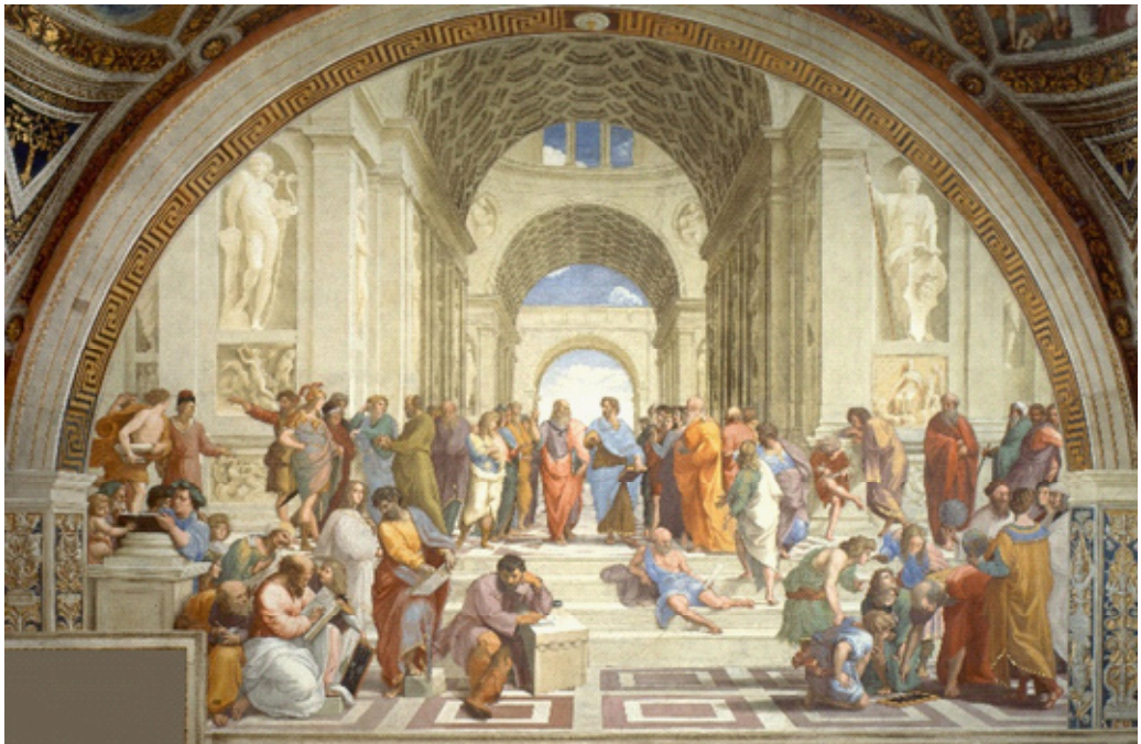
The School of Athens

The way in which we define and attempt to solve problems today has its origins in the philosophy of ancient Greece. Indeed, the rediscovery of classical philosophy in the 13th and 14th centuries was a major influence on the Renaissance. Let me refer to an example. Many of you will have seen this painting or be familiar with it. It was painted by Raphael in 1509 and is a fresco in the Apostolic Palace in the Vatican. It is widely considered as one of the finest pieces of art from the Renaissance. It is usually referred to as The School of Athens (although its formal name is Knowledge of Causes ).