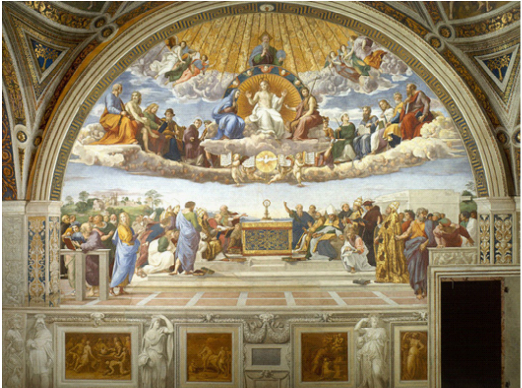
Disputation over the Most Holy Sacrament

Baptist and prophets and saints of the old and new Testaments. Beneath are Popes, saints and the faithful masses and with Aristotle, head slightly bowed and his books on the ground.