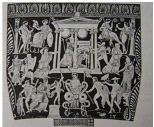
A piece of Greek pottery of an uncertain date and is thought to represent Euripides' Medea.