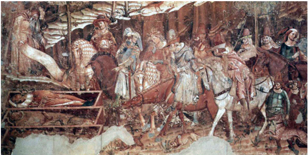
Fresco in Campo Santo, Pisa, by Francesco Traini, Triumph of Death.

Now let us move to the very early Renaissance — about 1350. Consider the fresco in Campo Santo, Pisa, by Francesco Traini, called Triumph of Death .