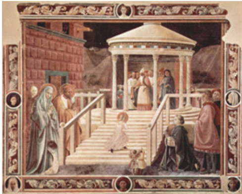
A scene by Paolo Uccello representing Mary approaching a temple.

What I have tried to show here are some of the foundational influences on the Western way of thought, as represented through its art. Whether or not Feyerabend's theory is correct is open to discussion but it is hard to accept as coincidental the extraordinary development in the sophistication of artistic representation that happened at the same time as the development of philosophical thought in centres such as Florence and Padua. As the influence of the Renaissance moved from Italy across Europe, the centre of intellectual thought gravitated towards Holland, to (what is now) Germany and to England. The discoveries and thinking of Copernicus, Galileo, Bacon, Locke and Newton, based on Greek philosophy, continued to develop within the mechanistic Greek paradigm — the universe was like a great machine overseen by God. This thinking prevailed until the 18th century when philosophers such as Kant and Hegel brought different perspectives to our interpretation of reality and the “interconnectedness” of everything in the universe. Nonetheless, the mechanistic paradigm persisted until the late 19th century. At about this time, biology and ecology began to develop and the mechanistic paradigm was insufficient to