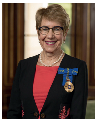
Patron of The Royal Society of NSW

Her Excellency The Honourable Margaret Beazley AC QC Governor of New South Wales