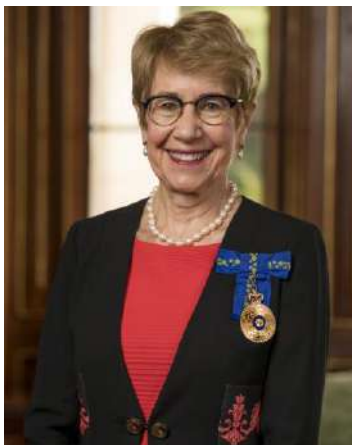
Patron of The Royal Society of NSW Her Excellency The Honourable Margaret Beazley AO QC Governor of New South Wales