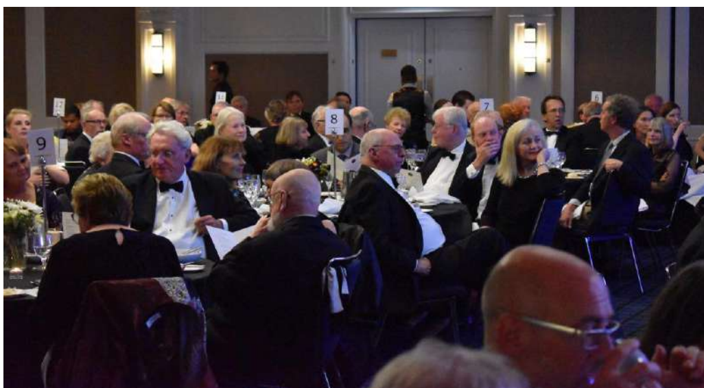
The Annual Dinner