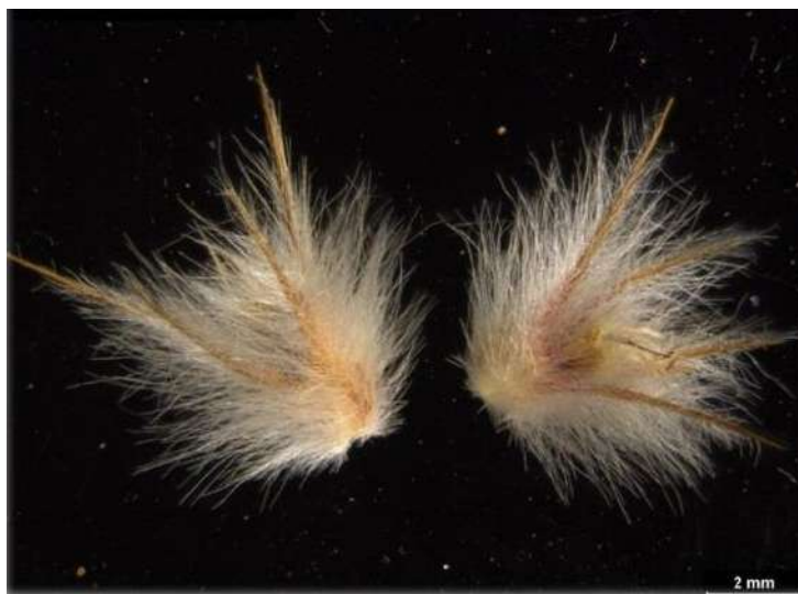
Seed of Sclerolaena fontinalis, Mound Spring Bindyi, a near threatened species

A major global approach to seed banking lies in the huge seed banking project, Kew's Millennium Seed Bank Partnership (MSBP), to which Australia is making a major contribution. This facility provides the best possible conditions for seed storage in a vast vault built under the laboratories, seed preparation areas and a public exhibition centre. Scientists from Kew's MSBP are sharing their expertise with members of the ASBP in the six states and the Northern Territory on seed collection processes, conservation and research. The overall priority is to bank plant species considered rare or threatened to dramatically enhance the conservation of the Australian flora. Kew now has partnership agreements with each of the states and territories as well as with CHABG. These agreements outline the nature of the collaboration and make explicit use of the collections and associated data and the resulting sharing of benefits arising from the collaborations.