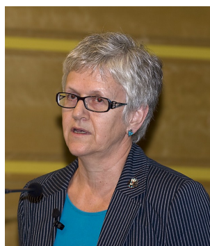
Professor Jill Trehwella

Nonetheless it is regrettable that the media often confuse opinion, fact and belief. Too much of the current debate focuses on belief. But belief is not important in many issues – what is important are matters of fact. This is particularly significant in major issues such as health and climate change where scientific knowledge is important. For example, in health investment in research is generally seen as overwhelmingly good. And it probably is but what about the unavoidable trade-offs in research in other areas? It is also regrettable that advertising is a major influence on public opinion and political processes.