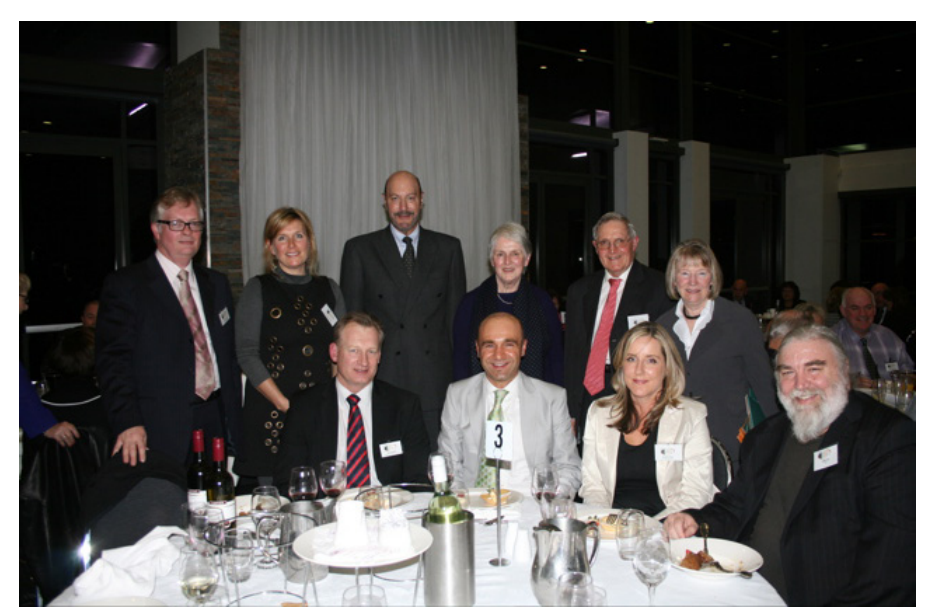
ACE distinguished guests at the NSW Sydney Metro Dinner Event