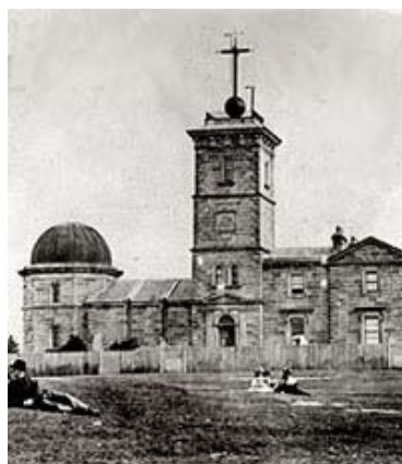
Sydney Observatory, about 1860

The full flyer and order form accompanies this Bulletin.