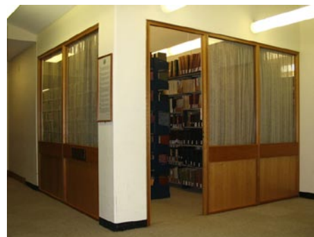
The locked room with a plaque proclaiming it to be 'The Royal Society of New South Wales Collection' located within the Dixon Library at the University of New England.