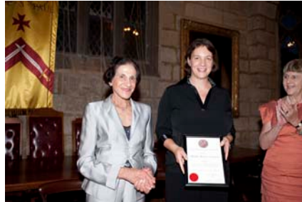
The Governor, Marie Bashir, presents Fellowship to Professor Michelle Simmons

The Society held its Annual Dinner for 2011 at St Paul's College, University of Sydney on Friday 18 February 2011. Our guest-of-honour was the Governor of NSW, Her Excellency Professor Marie Bashir AC CVO, one of our two Patrons and a long-standing supporter of the Society. We were also pleased to have three Deans of Science from universities in Sydney present. In her Occasional Address Her Excellency made reference to the antecedents of the Society and the work of one of her predecessors, Governor Lachlan Macquarie, in creating a climate in which Societies such as ours might germinate. We appreciate her support and that of the unbroken line of her predecessors.