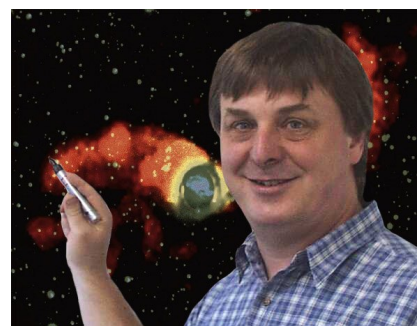
Presented by Dr Ray Norris.

The $160m Australian Square Kilometre Array Pathfinder (ASKAP) telescope is under construction in Western Australia. One of the key projects driving it is EMU - the Evolutionary Map of the Universe - which has an ambitious goal of studying the radio sky in unprecedented detail, to figure how galaxies evolved in the early days of the Universe and how they evolve to the Universe we see today, with stars, planets, rocks, trees, and astronomers.