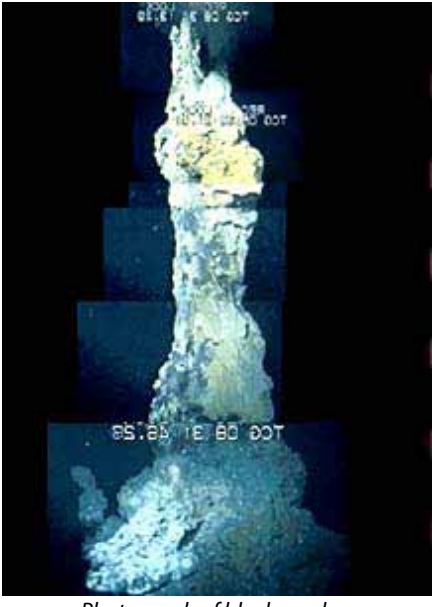
Photograph of black smoker.